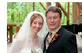
With my daughter at her wedding last May. I now have a NEW son-in-law.